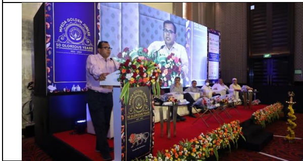
Felicitation by Shri. Uuvaraj Chowkilae, Joint Commissioner of Fisheries, Govt. of Maharashtra.