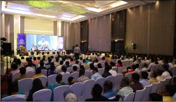
Aquaculture stakeholders attending the seminar.