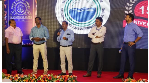
Technical Panel discussion on diversified aquaculture